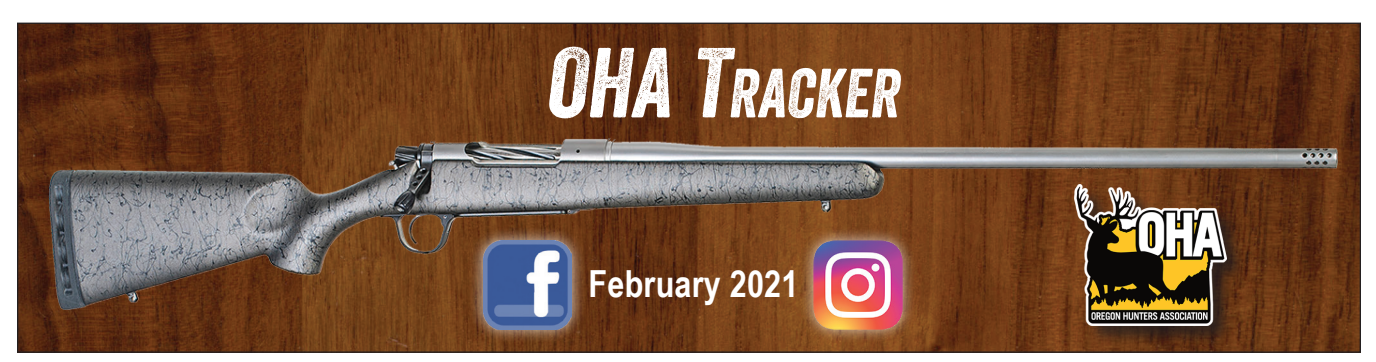
Many OHA chapters will feature a Christensen Arms Mesa Titanium in Coastal Farm & Ranch raffles. See schedule: https://oregonhunters.org/events/