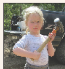
Violet was ready to turn violent with those rails.

The Pioneer Chapter kicked off OHA's youth event slate with a youth day at the Canby Rod & Gun Club.