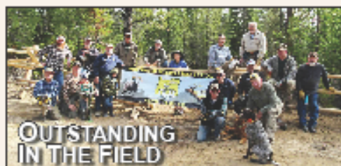
OUTSTANDING IN THE FIELD OHA members from three chapters joined forces to build over a half mile of buck & pole fence to protect habitat.

To learn more about these bills, visit www.oregonlegislature.gov/bills_laws