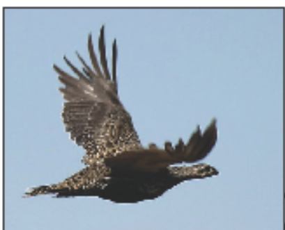
OHA testified in favor of continued science-based sage grouse hunting in Oregon.

The migratory gamebird proposed modification of the Zone 2 season for geese will simplify the complex goose hunting regulations. OHA supports