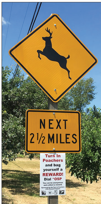
The number of deer killed on southern Oregon roadways is staggering.

Our next step is to undertake a feasibility study and preliminary design for the most practical and effectual sites to get wildlife across the interstate safely.