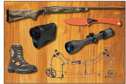
All OHA banquets offer an awesome array of great gear in lively auctions and raffles.

Funds used for this project will benefit the Warner Creek Correctional Facility's Sagebrush and Prisons Program to ensure its longevity and increase its capacity to assist in habitat restoration projects in Oregon.