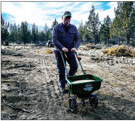
OHA staff and volunteers recently seeded an area of our new conservation easement that was damaged by the Grandview fire this summer.