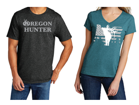
Check out these new designs and get free shipping at www.oregonhunters.org/store

For more information about the proposal, visit https://www.merkley.senate.gov/news/press-releases/merkley-wyden-introduce-bill-to-support-oregon-conservation-economic-development-2021