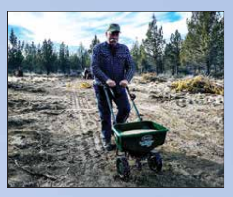
From funding fencing for the new Highway 97 wildlife underpass to seeding a burned area on our new conservation easement in central Oregon, OHA stepped up everywhere for conservation in 2021.