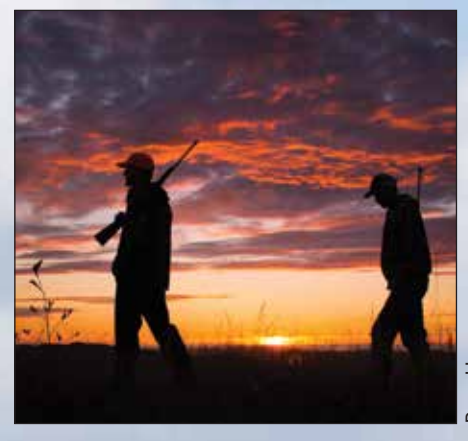
OHA's in-person and online courses and resources are helping newcomers learn to hunt.

In the end, the Fish and Wildlife Commission adopted rules that moved 11 units and two combined-unit zones to controlled hunts for archery elk. Changes made on the elk archery seasons will be implemented for the 2022 hunting season.