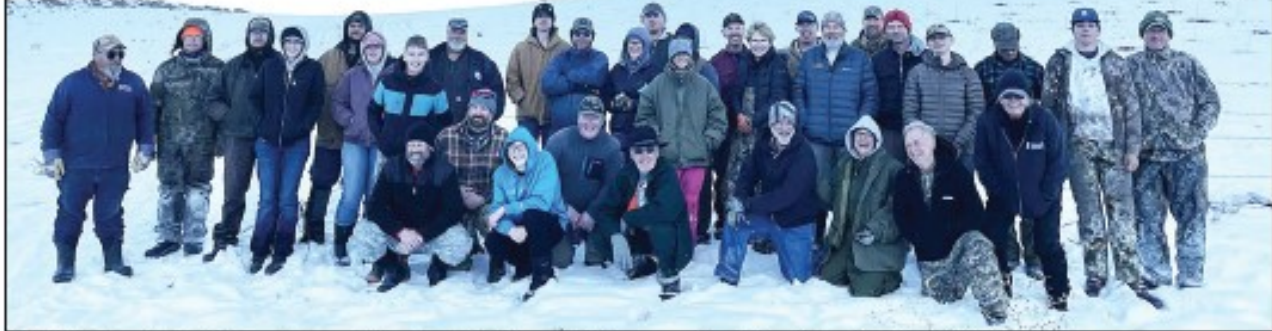
OHA volunteers braved sub-zero temperatures to plant thousands of forage seedlings in an Interstate Unit burn Nov. 19-21.