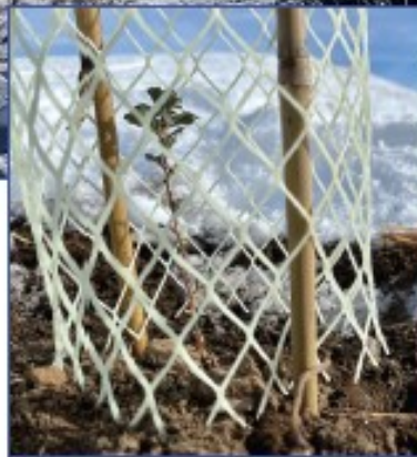
FREEZER BURN - OHA volunteer Jacob Haley plants a dormant seedling in the Bootleg Fire burn in Lake County, where morning temperatures were below zero on Nov. 20-21.

Elk Foundation ($10,000). Backcountry Hunters and Anglers donated more than $1,000 of sage and bitterbrush seed, and Legacy Sports International, Benchmade,