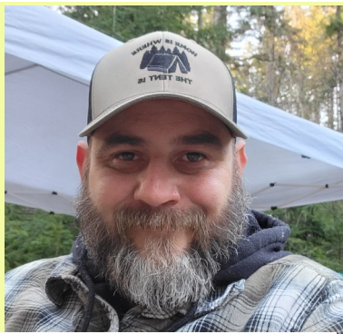
Cutting Edge Knife Services LLC