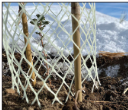
OHA will plant 4,000 seedlings in a wildfire burn in Lake County. Join us on March 25!