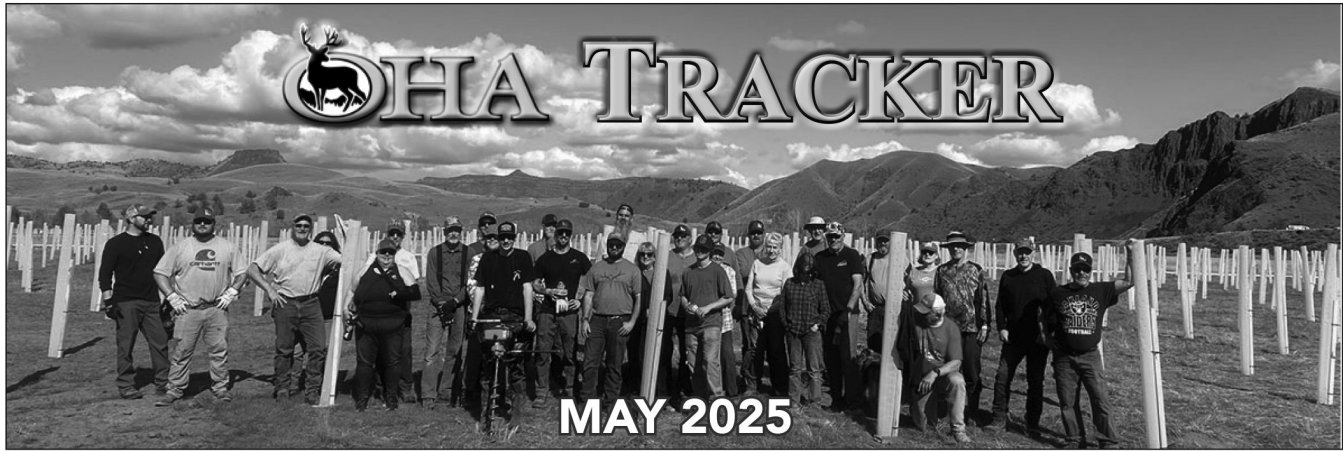
Redmond OHA volunteers planted 3,050 cottonwood trees in crucial winter range at Priest Hole on the John Day River the last weekend of March.